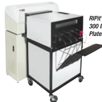
RIPit's 300 In-Line Platesetter