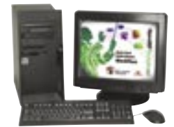
OpenRIP Symphony PS3, multi-device, multi-task RIP

RIPit Imaging Systems 7920 Alta Sunrise Drive, Suite 250 Citrus Heights, California 95610 phone: 888-947-4748 www.ripit.com